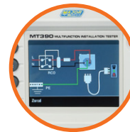
3.5" TFT Colour LCD Display with 320x240 Pixels