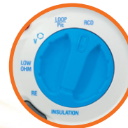
8 Functions: Insulation Resistance, Earth Resistance, Low OHM, Voltage, Loop Impedance, RCD, PSC/PFC & Phase Rotation