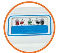
Safety Design with Sliding Shield Plate to Avoid Electric Shock