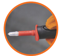
Test Probe with Test Button