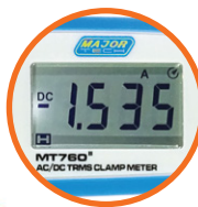
2000 Count Backlit LCD Display with 1mA Resolution