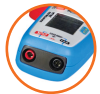
Rear Entry of Standard 4mm Test Lead Terminals