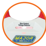
Red Light indicates detection of Non Contact Voltage (NCV)