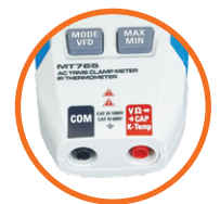
Rear entry of standard 4mm Test Lead Terminals