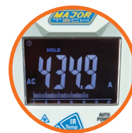
6000 Count Backlit Negative Colour Display