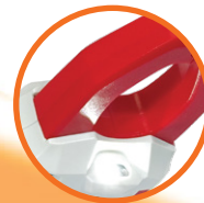
Meter includes flash light to light up area of test

MT765 | 600A AC Clamp Meter with IR Thermometer