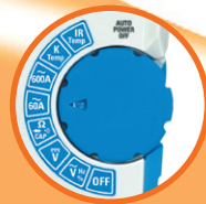
Illuminated functions for easy selection in dimly lit areas