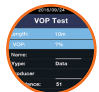
Built-in 20 groups of standard cable V.O.P value