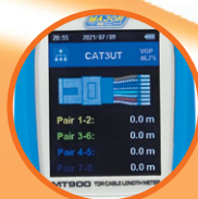
TFT Full Colour Screen